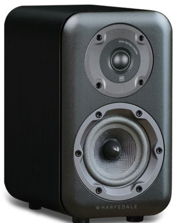
Above: Wharfedale D320 speaker in black finish