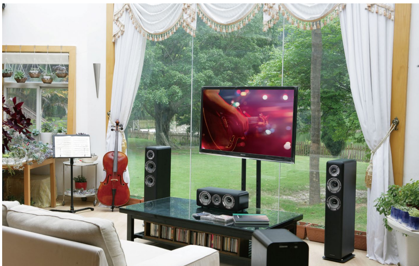
Above: Wharfedale D300 Series in black finish