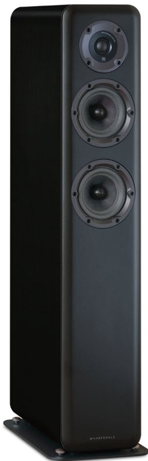
Above: Wharfedale D330 speaker in black finish