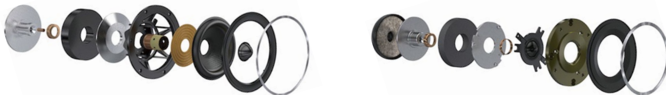
Above: Wharfedale D300 Series bass/mid driver assembly (left) and WFR tweeter assembly (right)

An over-sized ceramic magnet, selected to give a smoother transition from midrange to high frequencies, is attached to a pole piece with copper cap for flux control. The pole piece is vented through to the rear chamber to achieve a low resonant frequency, ensuring excellent linearity and allowing the textile dome, sited within a dished waveguide, to contribute to a wonderfully lucid midrange as well as smooth, pure and richly defined high-frequency detail.