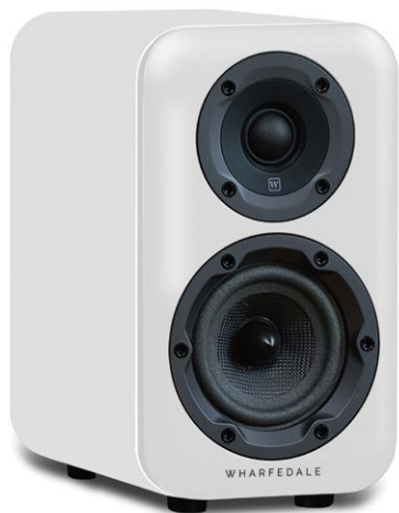
Above: Wharfedale D310 speaker in white finish

The result is a natural recreation of the fundamental notes of bass instruments, matching the realistic sound of the midrange and treble characteristics. It also allows the listener to position D300 Series speakers closer to a rear wall than would be possible with conventional rear-ported speakers, helping to make them less obtrusive in a room setting.