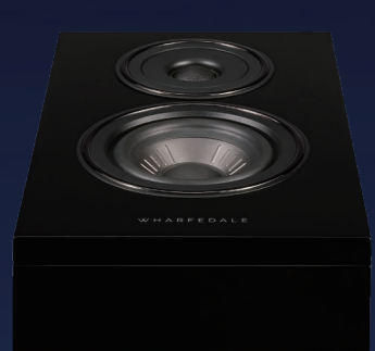
DIAMOND 12 3D