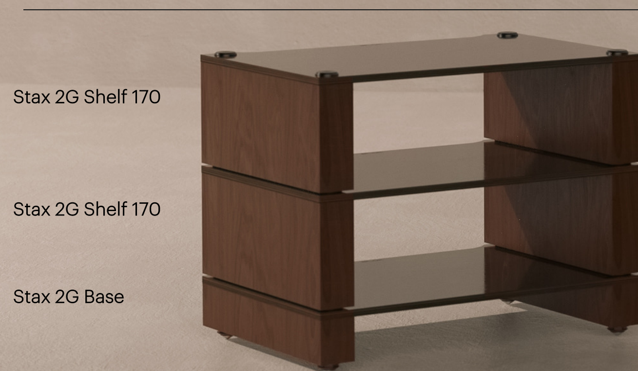
Stax 2G 3 Shelf Collection