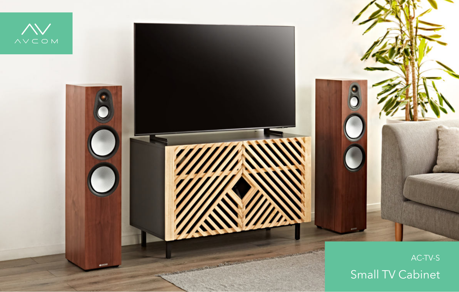
AC-TV-S Small TV Cabinet

The AVCOM Small TV Cabinet is perfect for organising your media setup with a touch of style. Providing a sturdy construction to keep your TV safe, the cabinet also features handy cut-outs for easy cable management, making it simple to keep your space tidy. With shelving specially designed for storing LPs, games consoles, or set-top boxes, this cabinet ensures everything is neatly arranged.