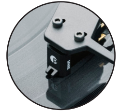
Special nose architecture protects the needle & offers easier alignment