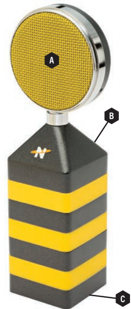
A: Capsule address side B: Power indicator light C: XLR input (underside)