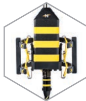
Thumbscrews on Beekeeper base

On vocals, the Honeycomb pop filter helps minimize sibilance as well as plosive (“p” and “b”) sounds. To fasten, locate the pop filter's half circle indentation, then align