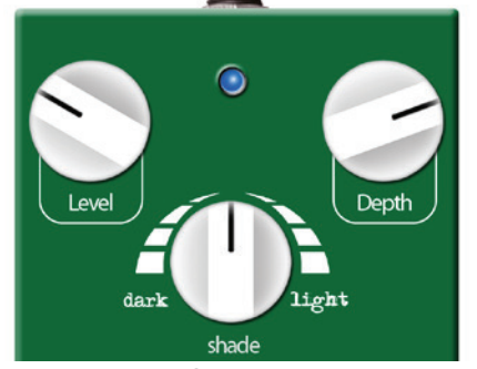
Long Springs, High Tension Level at 10 o'clock, Depth at 2-3 o'clock, Shade at Noon-1 o'clock

Any trademarks attributed that are not owned by Wampler Pedals, Inc. are for demonstrative purposes only, and are property of their respective owners