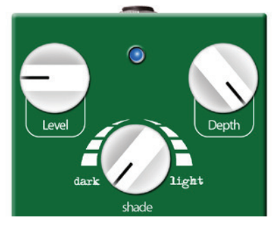
Ambient Texture (Sounds Amazing With Faux Tape Echo!) Level at 9 o'clock, Depth fully clockwise, Shade fully counterclockwise