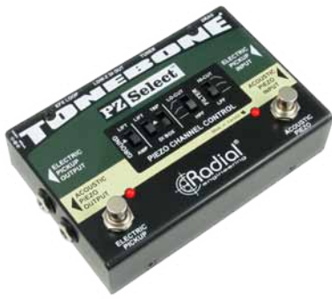
PZ-Select - Order # R800 7208

The Radial PZ-Select is a unique pedal that enables electric guitars outfitted with both magnetic and piezo transducers to be instantly controlled via a footswitch instead of fumbling around with the switches and potentiometers on the guitar. The PZ-Select takes the 'stereo' signal from the guitar and breaks it out into two separate signal paths. The electric pickup features class-A buffering with Drag™ control load correction to ensure the natural tone and feel of the instrument is maintained. This feeds a dedicated output to drive the on-stage guitar amp. The acoustic signal path is given a choice of both high-pass and low-pass 3-position filters to eliminate resonance and tame excessive top end. The signal feeds a standard 1/4" TRS effects loop and is then split to provide a separate feed for an on-stage acoustic amp and the built-in Radial DI box to feed the PA system. The footswitches let you activate either pickups or both may be used at once. When both are switched off, the signal still feeds an 'always on' tuner out for quick, on-stage adjustments. Ideally suited for players that switch between electric and acoustic instruments on stage.