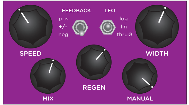
70's Vintage Flanger