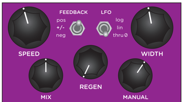
Keep Yourself Alive