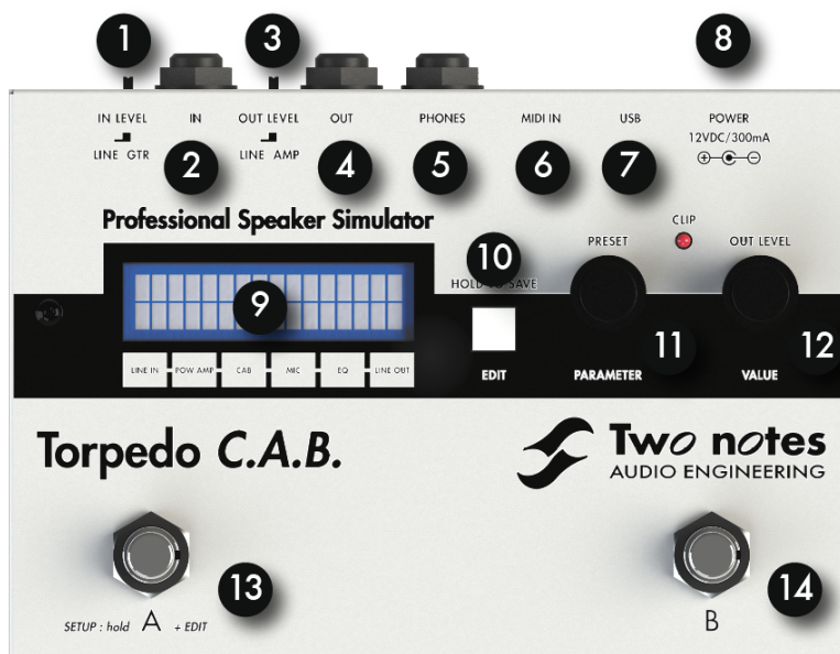
Figure 2.1: Front panel of the TORPEDO C.A.B.