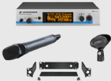
ew 500-935 / 945 / 965