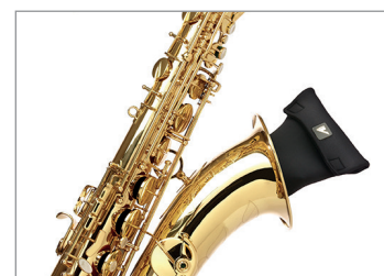
Includes soft storage pouch.