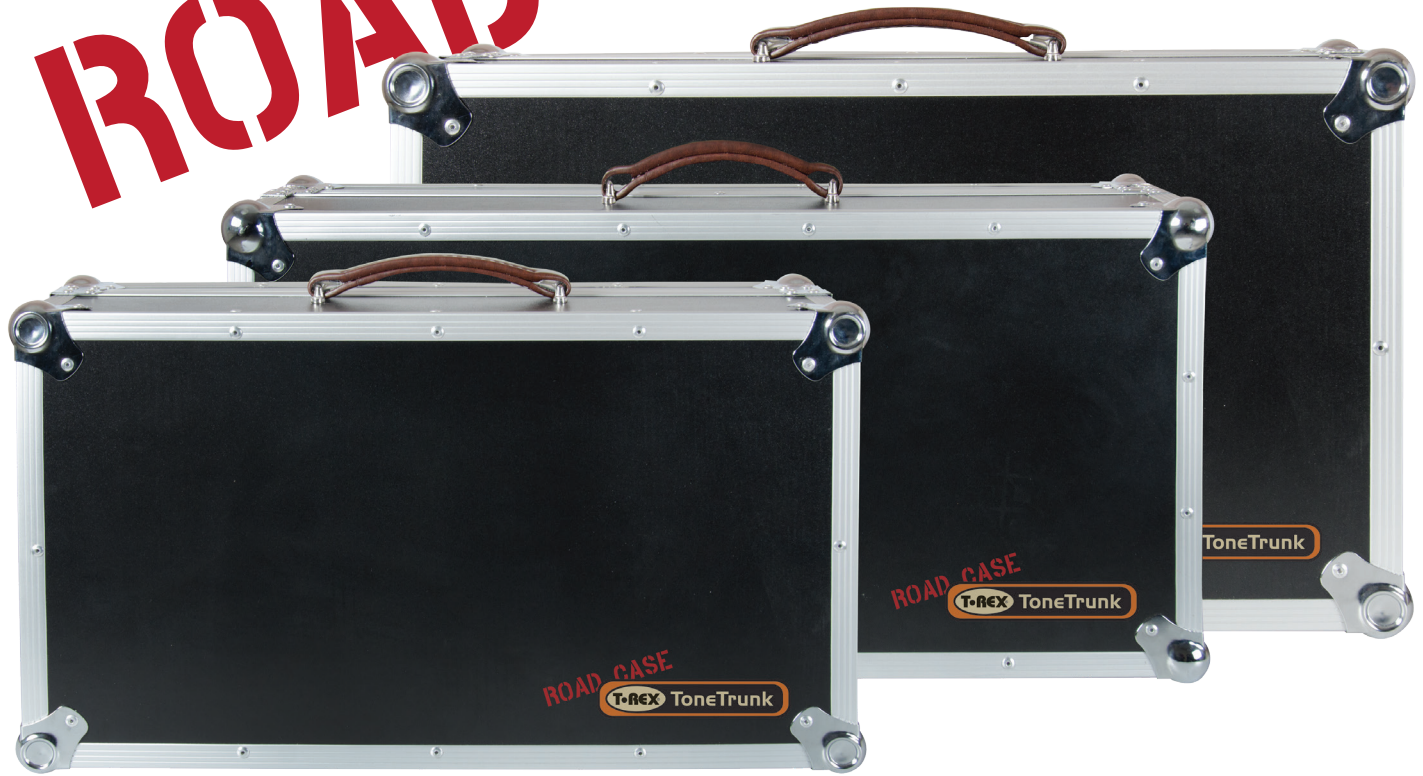
Road Case 56 Board Size: 560 x 316 mm 22.05 x 12.44 in