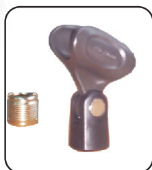
D1001S with locking function