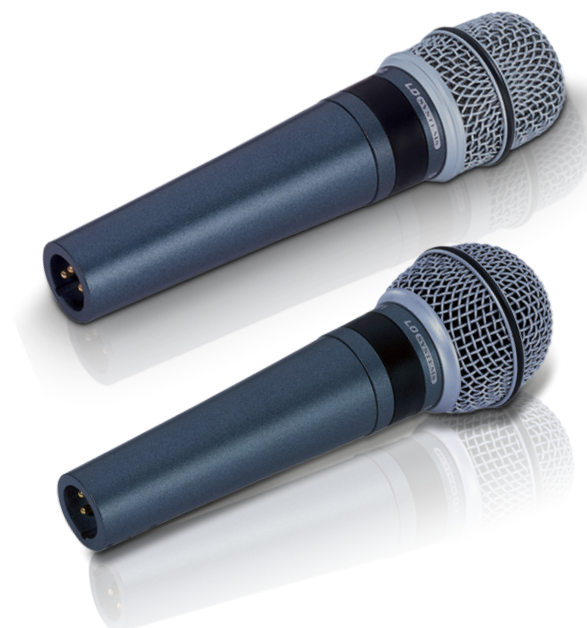
With Microphone holder