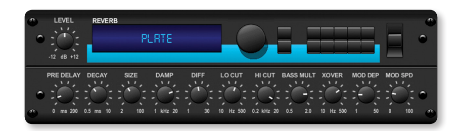
PLATE REVERB emulates the characteristics of a plate reverb chamber with control over the damping pad, modulation depth and speed, and crossover. PLATE REVERB will give your tracks the sound heard on countless hit records since the late 1950's. (Inspired by Lexicon PCM70*)

Digital Rack Mixer for Installed and Live Sound Applications with 40 Input Channels and 25 Mix Buses