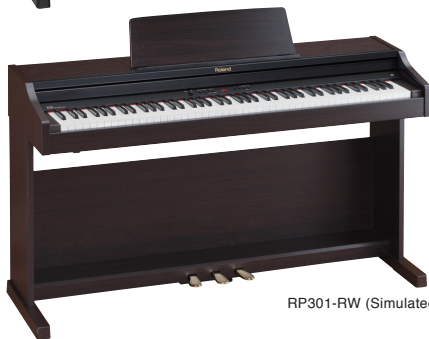
RP301-RW (Simulated Rosewood)