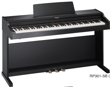
RP301-SB (Satin Black)