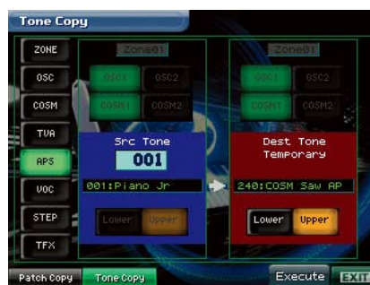
Tone Copy screen: Source and Destination blocks for quick copying