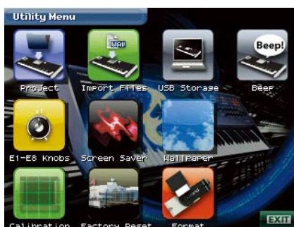
Utility menu: Friendly icons for fast navigation