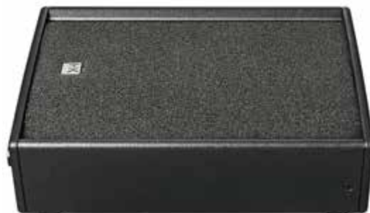
PR:O 12 XD

A fullrange cab in the classic 12"/1" format, this unit serves up a balanced sonic image and high SPL with remarkable speech intelligibility. The integrated DSP-based power circuitry delivers 1,200 watts to make the PR:O 12 D an assertive sound reinforcement tool. It's also the perfect satellite for the PR:O 18 S subwoofer.