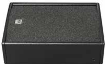
PR:O 10 XD

This truly multifunctional cab gets the job done nicely as a satellite, as a compact 10"/1" fullrange cabinet, or as a low-profile stage monitor. Its balanced frequency response defeats feedback and the Music/Speech knob tunes the unit for the given application. The integrated DSP-based power circuitry delivers 1,200 watts. And all this makes the PR:O 10 XD a powerful and flexible sound reinforcement tool.