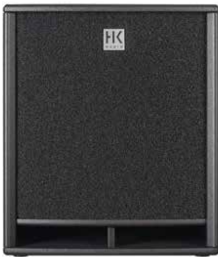
PR:O 18 SUB A

Featuring two 10" woofers in a bass reflex enclosure, this unit pumps out impressive low end with plenty of kick and surprising depth. Remarkably compact and weighing just 27.2 kg, this versatile unit may be placed upright or sideways. It is readily combined with mid/high units to configure a powerful yet unobtrusive easy-to-use system that delivers outstanding performance. In addition to the 600-watt power amp, the PR:O 210 SUB A is equipped with a stereo preamp for 2.1 setups.