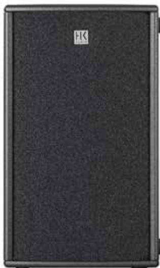
PR:O 210 SUB A

Featuring two 10" woofers in a bass reflex enclosure, this unit pumps out impressive low end with plenty of kick and surprising depth. Remarkably compact and weighing just 27.2 kg, this versatile unit may be placed upright or sideways. It is readily combined with mid/high units to configure a powerful yet unobtrusive easy-to-use system that delivers outstanding performance. In addition to the 600-watt power amp, the PR:O 210 SUB A is equipped with a stereo preamp for 2.1 setups.