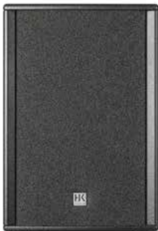
PR:O 12 D

This truly multifunctional cab gets the job done nicely as a satellite, as a compact 10"/1" fullrange cabinet, or as a low-profile stage monitor. Its balanced frequency response defeats feedback and the Music/Speech knob tunes the unit for the given application. The integrated DSP-based power circuitry delivers 1,200 watts. And all this makes the PR:O 10 XD a powerful and flexible sound reinforcement tool.