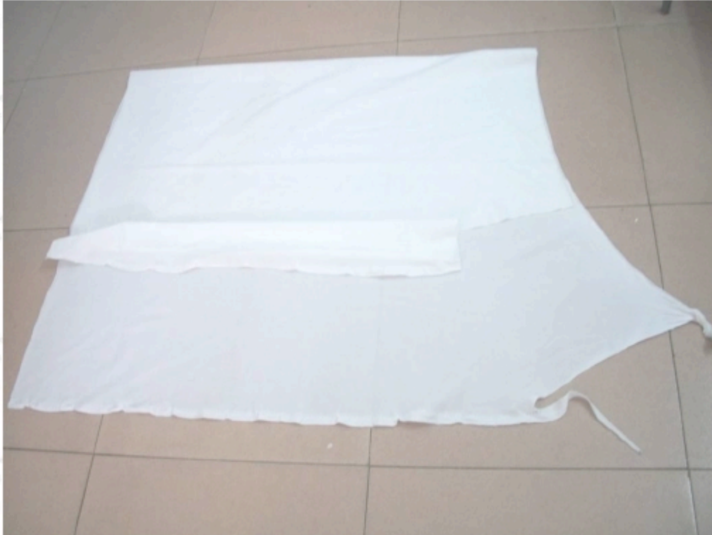
Overall View of Sample