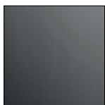
Black High Gloss Cabinet