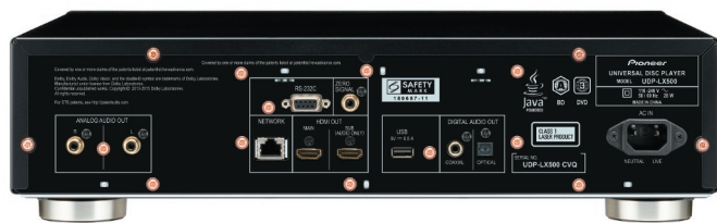
UDP-LX500(B)CVQ3AP (Asia model)