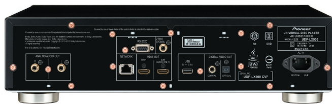
UDP-LX500(B)CVF3AN (Taiwan model)