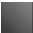
Black High Gloss