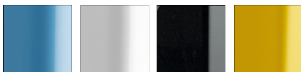
Gauloise Blue Carrara White Black Lacquer Solar Yellow