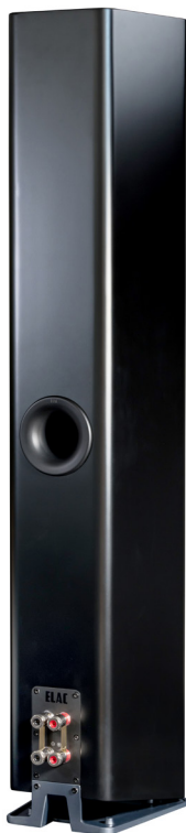
Back Carina FS 247.4