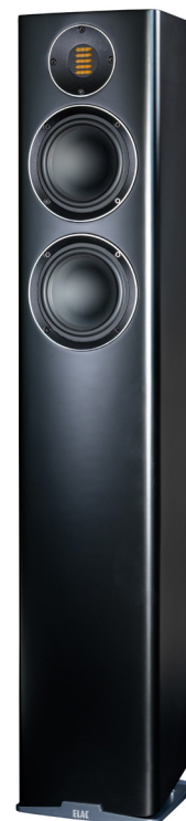
Front Carina FS 247.4