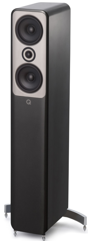
Concept 50 Floorstanding speaker £1,999