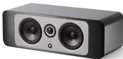
Concept 90 Centre speaker £649