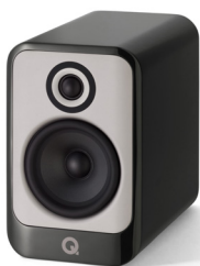
Concept 30 Standmounting speaker £899

Q Acoustics introduces the newest models of its award-winning series of Concept stereo and home cinema loudspeakers. Taking cutting-edge acoustic technology and design cues pioneered in the flagship Concept 300 and 500, while also introducing new state-of-the-art audio innovations, the new Concept 30 standmount, Concept 50 floorstanding and Concept 90 centre channel models deliver truly high-end home audio performance without spending high-end money.