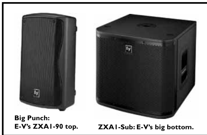
Big Punch: E-V's ZXAI-90 top.

The injection-molded enclosure, on the ZXAI-90, is made from high-impact ABS for durability and it's lightweight.