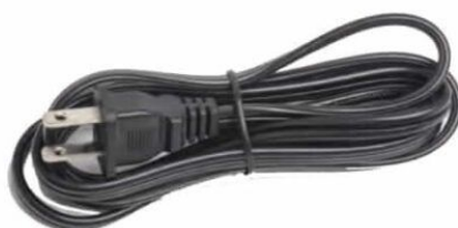
North American mains cable