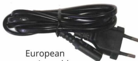
European mains cable