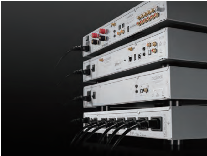
Left The DC Block 6 (bottom of the stack) feeding clean, rebalanced AC power to Audiolab audio components