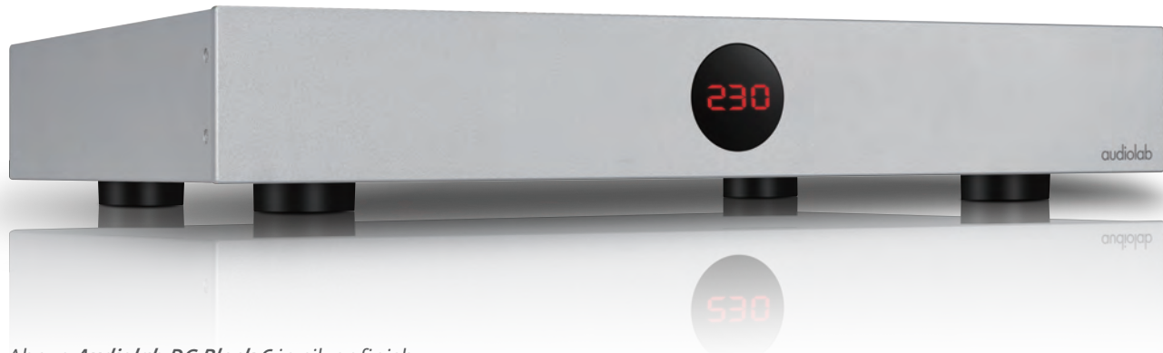
Above Audiolab DC Block 6 in silver finish.