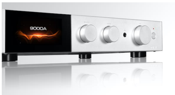
Left The 9000A is the perfect integrated 'hub' for all manner of digital and analogue sources

Users can opt to upsample digital audio signals to 352.8kHz or 383kHz, and five DAC reconstruction filter settings allow the listener to adjust the sound to suit the source material – particularly useful given the variable quality of digital formats and streaming platforms. No matter how it is connected, via USB, S/PDIF or Bluetooth, every digital source benefits from the exceptional quality of this DAC – you will not find a finer DAC stage in any integrated amplifier anywhere close to the 9000A's retail price.