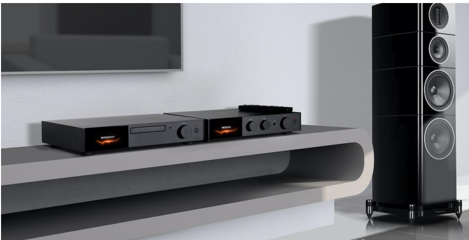
Left The 9000A integrated amp and matching 9000CDT CD transport are available in classic Audiolab black as well as silver

Finally, 'Pre Mode' disables the power amp stage, turning the 9000A into a standalone DAC/preamp. This enables external power amplification to be added, thus providing a possible upgrade path.