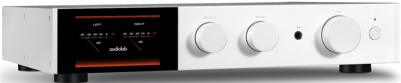
Above Audiolab 9000A in silver finish