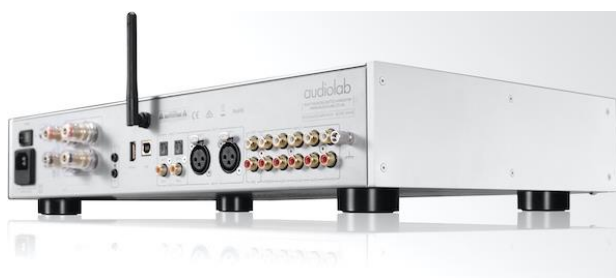
Left The 9000A is well stocked with an array of analogue and digital connection options

While this wealth of connectivity is impressive, the 9000A does not include built-in network streaming. From a performance point of view, incorporating network streaming of sufficient quality to match the amp's sonic ambition within the same chassis would have meant compromising performance in other areas – the 9000A is, first and foremost, a high-performance integrated amplifier. Also, not everyone requires network streaming; by developing a separate, dedicated audio streamer for the 9000 Series – set to arrive in early 2023 – Audiolab is able to deliver optimal performance and system flexibility.