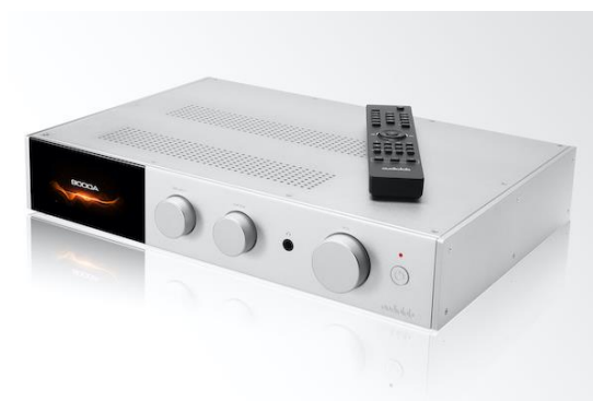
Left The 9000A is perfectly formed to become the beating heart of a vibrant and versatile high-performance audio system

The preamp section is kept as simple as possible to maintain signal purity, with line input signals passing to a precision, microprocessor-controlled analogue volume stage. Much effort has gone into the physical layout of the 9000A's circuitry, protecting the sensitive preamp section from noise interference. This, plus the use of independent low-noise power supplies for critical stages, helps to deliver a performance on par with much more expensive two-box pre/power amp systems.