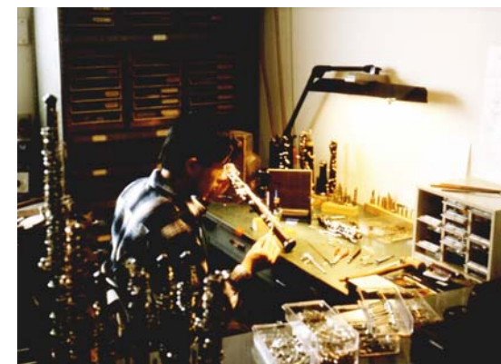
Most of our craftspeople are musicians themselves. They joined Yamaha because of their love of music and their feeling for musical instruments. Every single oboe receives close and individual care at every stage of its creation.

Full-automatic octave keys 3rd octave key Left-hand F key Fork F resonance key Right-hand Triple-C system Low B-C linkage key F roller key Trill keys: Low B-C ♯ , low C-D ♯ , C ♯ -D ♯ , D ♯ -E, F ♯ -G ♯ , G ♯ -A, A ♯ -B ♯ , A ♯ -B, B-C ♯ , left C-D, right C-D 9 cork, 14 felt pads Grenadilla body Silver-plated nickel silver keys