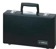
200 Series Case