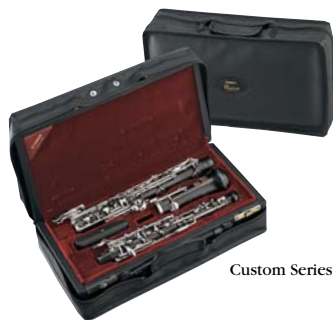
Custom Series Case

Yamaha Custom oboes feature a deluxe case with case-cover which provides attractive and convenient protection for your instrument.