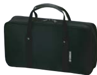
400 Series Case